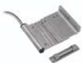
Roller Door Sensors