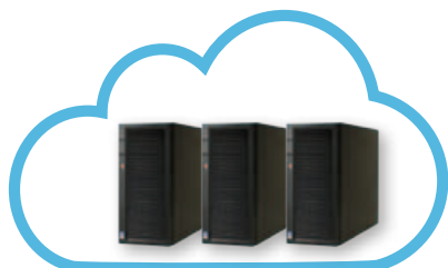
RISCO Cloud Server

With VUpoint there is no limit to the number of IP cameras that can be installed and configured to the intrusion system, thereby providing increased revenue potential for installers. IP Cameras are available for both indoor and outdoor environments and provide a cost-effective security solution for homes and businesses.